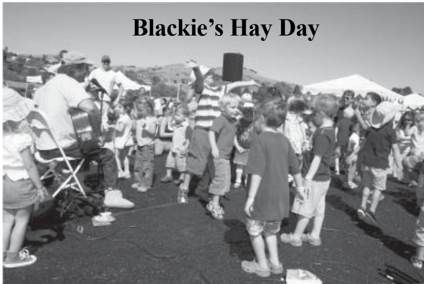
Blackie's Hay Day

For the second year in a row, Blackie's Pasture was turned into the site of a wonderful old-fashioned country fair. Organized and run by the Bookmarks group of the Library, the fair delighted over 500 children, as well as their grownups, with pony rides, a petting zoo, family