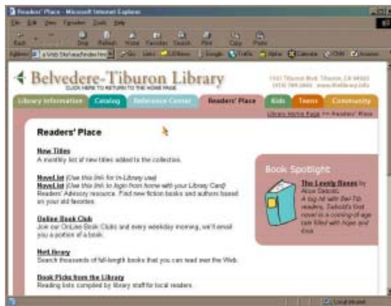
New department page