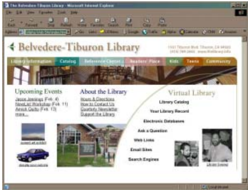
New home page